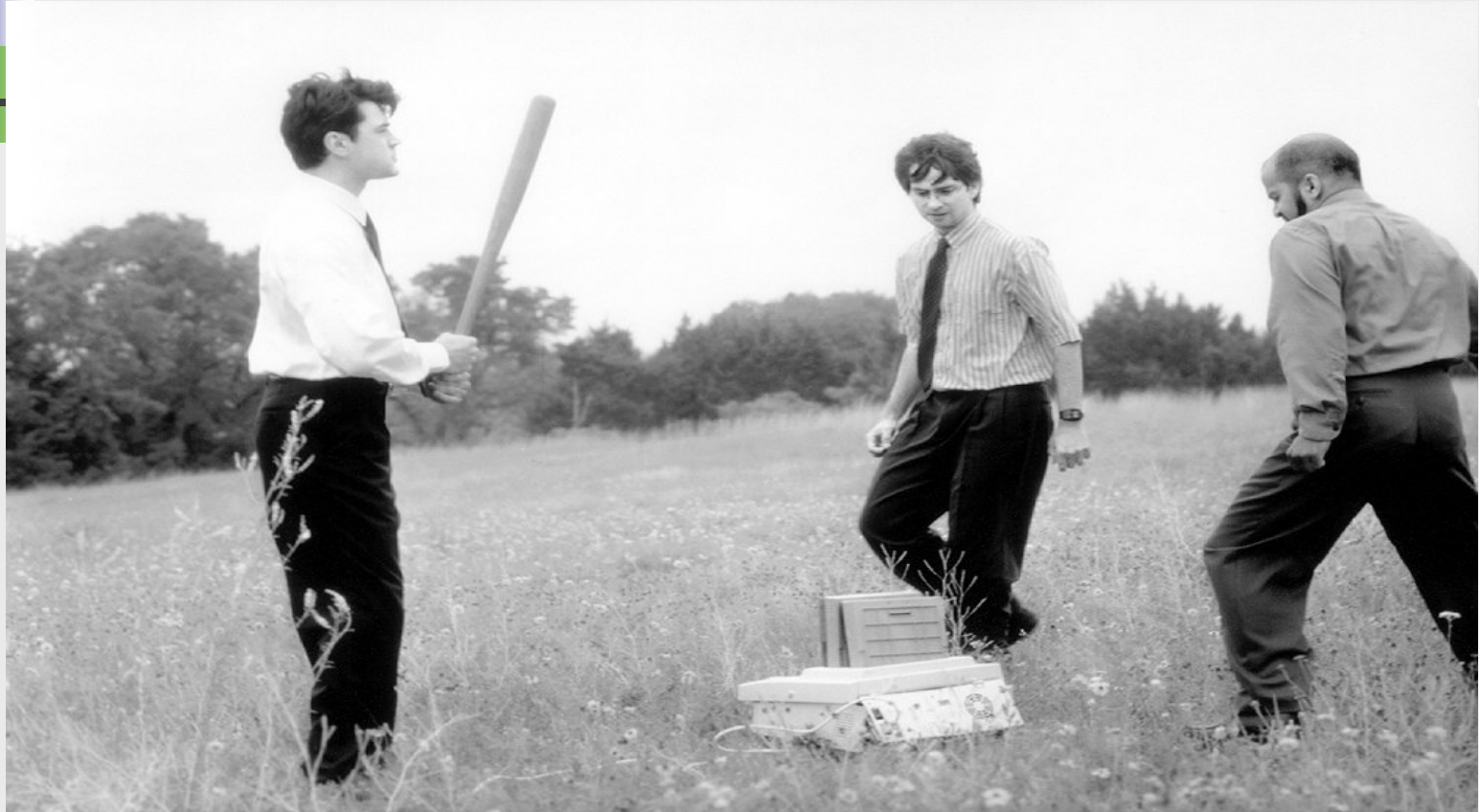
Still photo from: Office Space (1999) - Ron Livingston, Ajay Naidu, David Herman